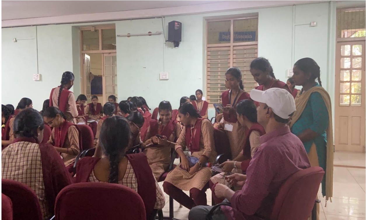
CPBFI Certificate Course (96 Hours) Bajaj Fin Services from 21-03-2024 to 10-04-2024