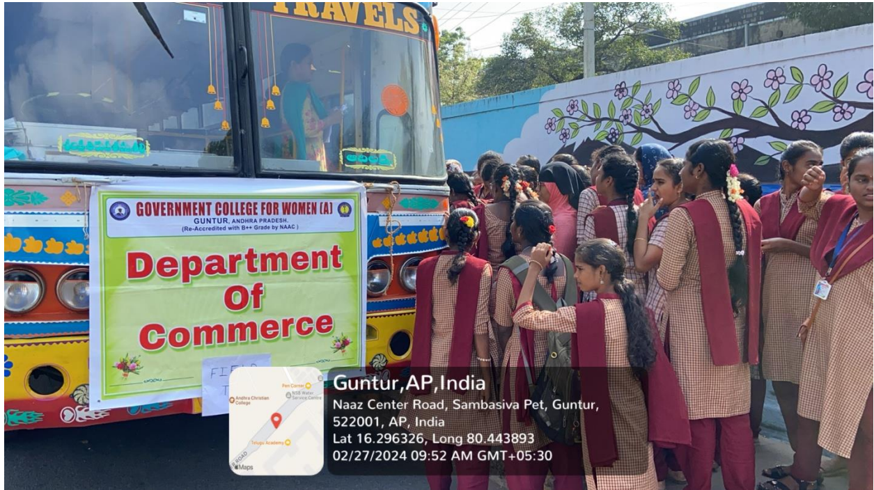
Student Study Filed Trip Programme at XXX Soaps Company, Amaravathi, Guntur on 27-02-2024.